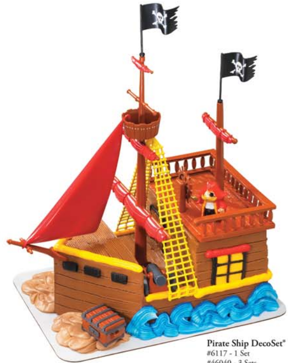
Pirate Ship DecoSet® #6117 - 1 Set #46040 - 3 Sets