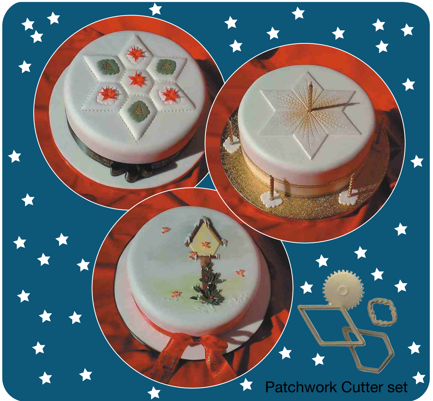
Patchwork Cutter set

Quick & simple Christmas ideas all created using this four piece set.